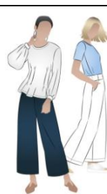
Fifi woven pant Style Arc