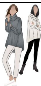
Freya knit tunic Style Arc