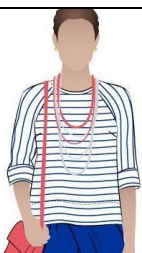
Maddison Style Arc

Students are welcome to enrol in these workshops as often as they wish. Please call Vikki to discuss your project on 0417 597 189