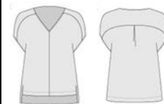
Sutton Blouse True Bias